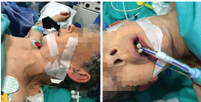
Image 2. Predicted Difficult Airway management in case two